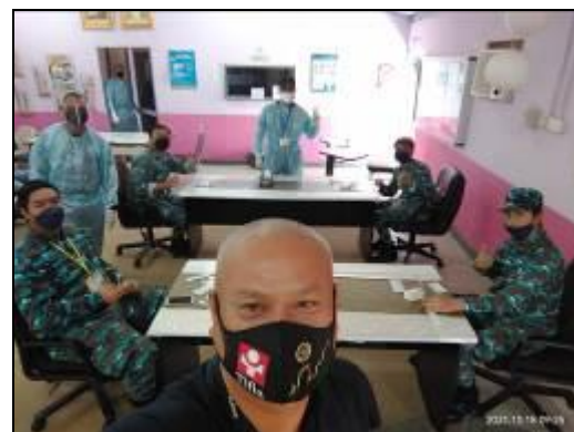
As Front Liners @ Isolation Centres in Brunei Muara and Belait Districts