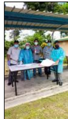
Assisting Head Villages on Payment of Old Age Pensions and Monthly Welfare Allowances (Drive Through)