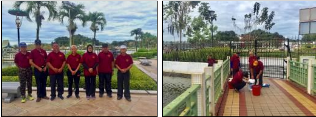
Day of Action (International Volunteers Day) @ Masjid Omar 'Ali Saifuddin