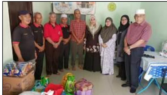
Welfare Visits to Members of VARBAF (In Need)

Your Excellencies, Distinguished Guests, Ladies, and Gentlemen.