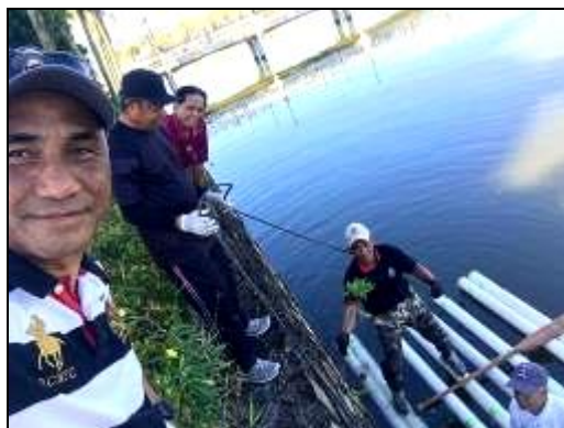
Combined Campaign @ Masjid Omar 'Ali Saifuddin