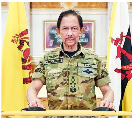
His Majesty Sultan Haji Hassanal Bolkiah Mu’izzaddin Waddaulah ibni Al-Marhum Sultan Haji Omar ‘Ali Saifuddien Sa’adul Khairi Waddien, Sultan and Yang Di-Pertuan of Brunei Darussalam delivers the titah.

His Majesty Sultan Haji Hassanal Bolkiah Mu’izzaddin Waddaulah ibni Al-Marhum Sultan Haji Omar ‘Ali Saifuddien Sa’adul Khairi Waddien, Sultan and Yang Di-Pertuan of Brunei Darussalam announced that Brunei Darussalam will move into the Endemic Phase under the National COVID-19 Recovery Framework on December 15.