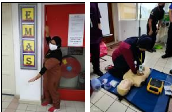
As Front Liner @ International Conference Centre

Your Excellencies, Distinguished Guests, Ladies, and Gentlemen.