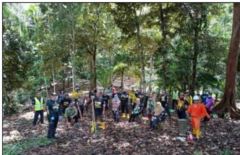
Combined Campaigns @ Kampung Merangking