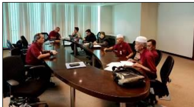
Joined Working Committee (Protocol and Invitation) for Royal Brunei Armed Forces' Diamond Jubilee Celebration