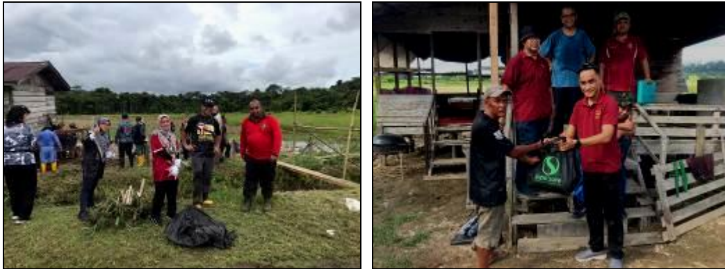
Cleaning Campaigns @ Kampung Labi

We share some of these experiences in the pictures below: