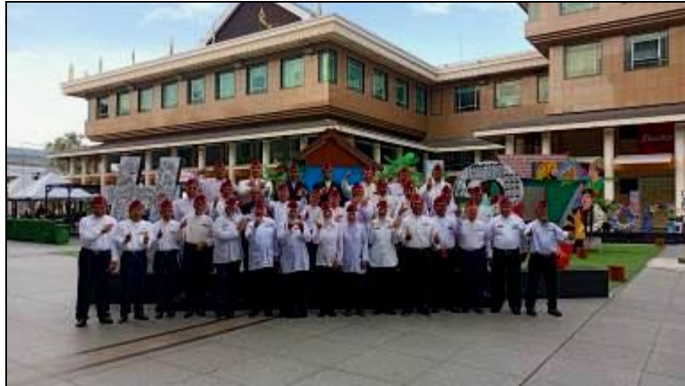
Participating in the 37 th National Day 2021