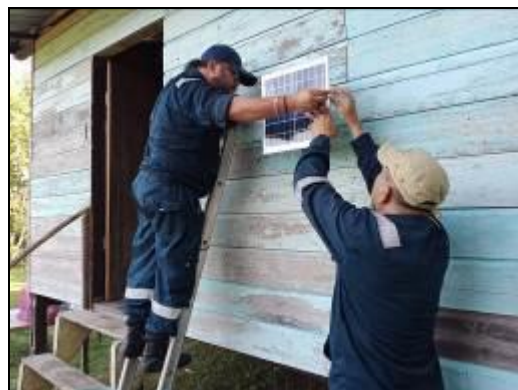
Installing Solar Lights @ Kg Merangking