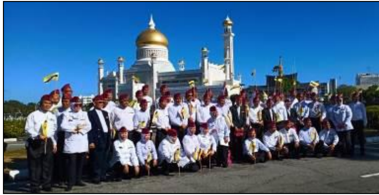
Participating in the 36 th National Day 2020