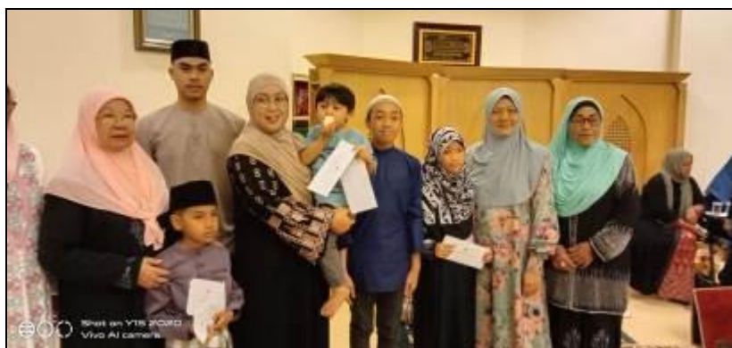
Celebrating VARBAF's 29 th Anniversary @ Bolkiah Garrison