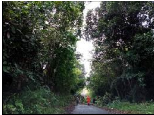
Joined Campaign @ Kampung Bukit Sawat