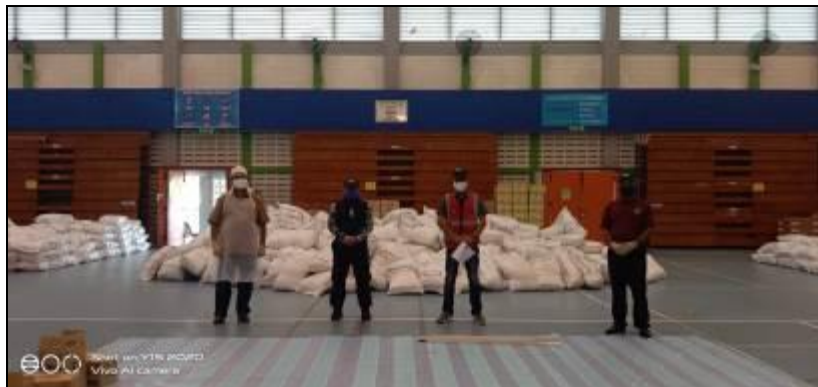
As Front Liners @ HQI Centre in Belait District