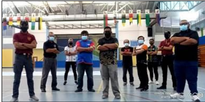
The Initial Front Liners Team that set up Ration Distribution Centres for Home Quarantined Individuals (HQI) in Belait and Tutong Districts