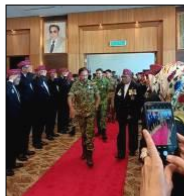
Protocol Duty during the Royal Brunei Armed Forces' Diamond Jubilee Celebration Luncheon @ Tarindak D'Seni